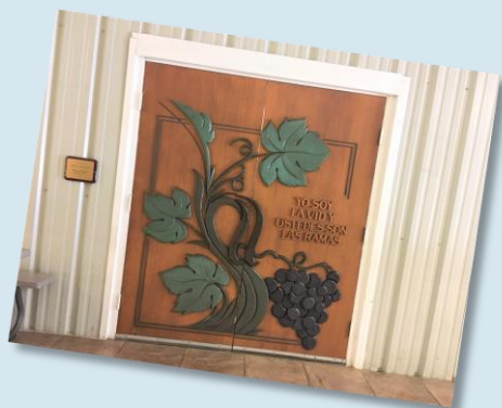
The door to the sanctuary at Beth-el. It says "I am the vine. You are the branches" in Spanish.

More photos of our youth learning (and doing) mission work