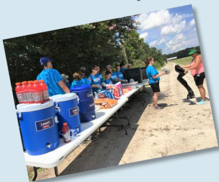
All ready to hand out hot dog lunches and household supplies to workers on a farm in Durant